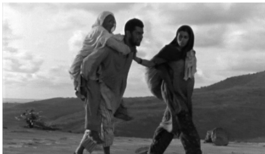
Figure 3.5 The epic journey into exile: Tamas .