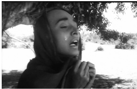
Figure 3.4 Yamuna abandoned by all, Ghattashraddha .

the other hand, confronts directly the consequences of Muslim identity in post-partition India. In the early 1970s, that Garm Hawa goes back to the immediate aftermath of Partition and represents the painful experiences of a Muslim family in Agra under intense pressure to leave for Pakistan is clearly indicative of an attempt to give voice to a repressed history in public discourse, and draw attention to the forces of communalism that had not ended with Partition.