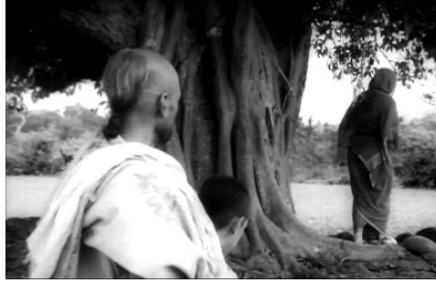
Figure 3.3 The outcast Yamuna in Ghattashraddha .