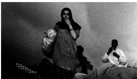
Figure 3.6 Death in life: the debris of the Partition in Tamas.

contemporary Bombay with its explosive communal situation. Both films look at the dead end facing the community, and so if the Bhiwandi riot of 1984 marks the everyday in Salim Langde Pe Mat Ro , in Naseem it is the build-up to the demolition of the Babri Masjid in 1992 in the months preceding 6 December that imbues the life of an ordinary Muslim family with extreme tension, insecurity and finally reactive anger on the eve of the riots that follow the demolition. The gentler past of friendship and understanding between communities that Naseem's grandfather evoked through his qissas (stories) spoke of a world that had definitely ceased to exist. Shyam Benegal's Mammo (1994) also looks at the fallout of this history and the difficulties faced by Muslims who have families scattered across the two nations. The eponymous character, Mammo, radically redefines the meaning of home, rejecting national identities thrust upon individuals by history and politics, as she refuses to accept that the afterlife of Partition in the policies of the two nation states will dictate to her what her choice of home ought to be.